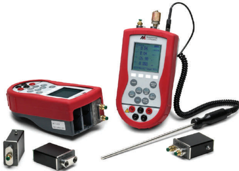
MFC 4000 Calibrator with HART communicator option

DSM Software allows a full management of your instrument database with history, and report generation with data from both the MFT4000 Calibrator and the MFC4100 Hart Communicator.