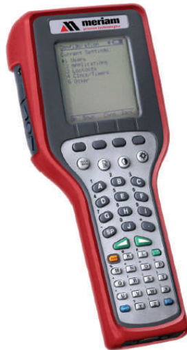
MFC4100 HART communicator

The original HART communicators only worked with one manufacturer's equipment. With the growing popularity of