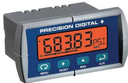
Loop powered, backlit display

The PD688 is an FM Approved & CSA Certified intrinsically safe and non-incendive loop-powered digital meter. The PD688 can be installed almost anywhere because of the approvals and the large backlit LCD. It can be easily